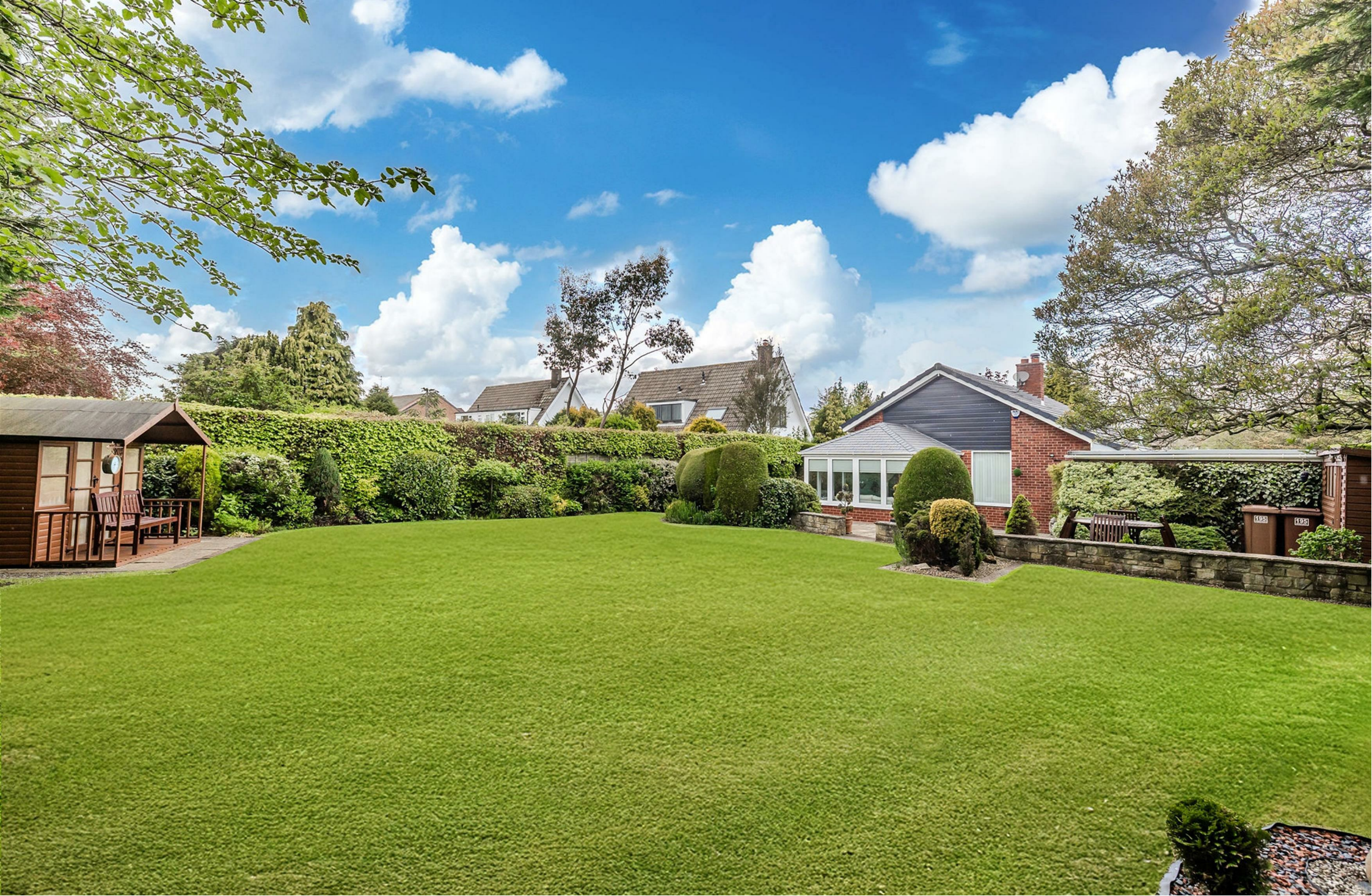
195 Middle Drive, Darras Hall, Ponteland, NE20 9LU